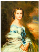
8161: OIL PAINTING ON CANVAS OF A PRETTY GIRL'S PORTRAIT

Each depicting a house within a rural setting, surrounded by trees. Signature on each to read R. Whitely. H: 12 in., L: 16 in.