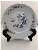
8031: ANTIQUE CHINESE FAMILLE ROSE ROOSTER PLATE

The bowl is raised on a short foot, with fluted design on the body. H: 3 1/2 in. x Diameter: 8 in.