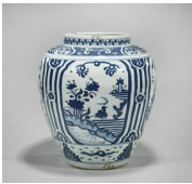
8027: CHINESE BLUE AND WHITE JAR

Dressing in a long, loose robe, wearing a necklace with bare foot. Holding a bag across his left shoulder. With a stamped mark on the bottom. H: 11 in.