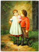
8158: OIL PAINTING ON CANVAS OF PLAYMATES