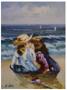
8159: OIL PAINTING ON CANVAS OF TWO GIRLS ON THE BEACH

Two playmates happily together. The girl holds books on her arms and the boy with a dancing rope in his hand. Signature is on the bottom left corner. H: 16 in. L: 12 in.