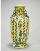
8083: CHINESE YELLOW GROUND PORCELAIN VASE

Beautifully painted with blossoming chrysanthemums and scrolling leaves around the body as well as on the lid. Double-ring mark on the bottom. H: 12 in.