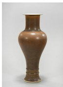
8046: CHINESE GLAZED PORCELAIN VASE

Of gu form, beautifully painted with blossoming tree around the body. Four-character mark to read Kangxi on the bottom. H: 10 3/4 in.