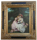
8124: OIL PAINTING ON CANVAS OF TWO YOUNG WOMEN

In an outdoor setting. Signature to read J. Mills. 24 in. (L) x 20 in. (W)