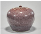
8084: CHINESE PEACH BLOOM GLAZED JAR WITH LID

Beautifully painted with blossoming trees against a yellow background all around the vase. Adorned with carved fruits in relief on the shoulder. H: 18 in.