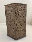
8028: ANTIQUE CHINESE CARVED BAMBOO HEXAGONAL BRUSHPOT

Painted with land and water scenes with ducks around the body. H: 16 1/4 in.