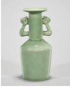
8025: CHINESE CELADON VASE