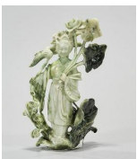
8087: CHINESE CARVED STONE FIGURE OF HE XIANGU

Painted with swimming fishes on the body. H: 13 in. x W: 9 in.