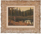
8040: CANADIAN OIL ON CANVAS PAINTING OF A FISHING MAN