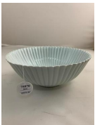
8030: ANTIQUE CHINESE FLUTED BLANC DE CHINE BOWL

Depicted smiling in tranquil meditation. H: 2 1/2 in.