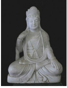
8079: ANTIQUE MARBLE FIGURE OF SEATED BUDDHA