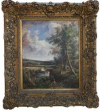
8122: LANDSCAPE OF STREAM AND CLOUDY SKY PAINTING