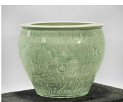
8088: CHINESE CELADON CRACKLEWARE JARDINIERE

Dressing in a flowing gown and holding lotus flower. H: 8 in.