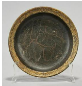
8125: CHINESE DARK BROWN PORCELAIN PLATE

Each wears a dainty flowing dress. With a forest and a river behind them. H: 24 in., L: 20 in.