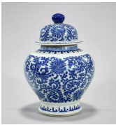
8082: 19TH CENTURY CHINESE BLUE AND WHITE LIDDED JAR

Positioned seated upon a lotus pedestal, eyes closed in meditation with right hand in 'gesture of witness' mudra and left in 'gesture of leisure' mudra. Snail shell curls with gilt bronze "golden rock" atop. Wearing gilt bronze robes with cast bronze images of Buddha all over. H: 30 in.