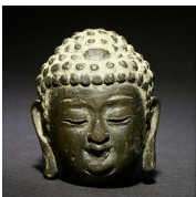
8029: 18TH CENTURY CHINESE BRONZE FIGURE OF BUDDHA'S HEAD

Of republic period, intricately hand-carved with great details of dragons chasing flaming pearls. H: 12 in.