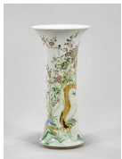
8045: CHINESE ENAMELED PORCELAIN VASE

Raised on a splayed foot, with a bulbous body, flanked by a large flaring neck and mouth. Beautifully painted with phoenix, birds and blossoming flowers around the vase. Six-character mark to read Kangxi on the bottom. H: 16 1/2 in.