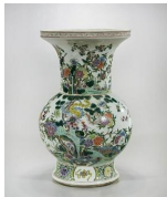
8044: CHINESE ENAMELED PORCELAIN VASE

With a lid. Carved with ducks swimming in a lotus pond on the body, against a dark blue background. H: 25 1/2 in. x W: 6 1/2 in.