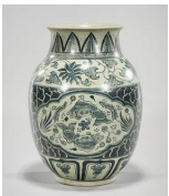
8086: CHINESE BLUE AND WHITE CRACKLEWARE VASE

Of a bulbous form, flanked by a small finial atop of the lid. H: 10 in. x W: 12 in.