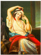
8162: OIL PAINTING ON CANVAS OF A PERSIAN WOMAN

Of a pretty girl wearing blue dress. H: 16 in. L: 12 in.