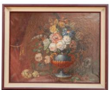
8211: FRAMED OIL ON CANVAS PAINTING OF STILL LIFE

Signature to read Guinta. H: 20in. L: 23 1/2in.