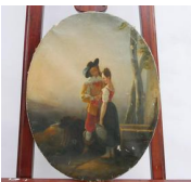
8030: ANTIQUE OIL ON CANVAS PAINTING OF LOVERS

Oil on canvas painting depicts a beautiful seashore scene with waves crashing on the beach under moonlight. Signature to on bottom left to read Carbu.Francois (Carbuccia) Carbu, was a French artist who was known for painting of seascapes and boats.H: 21 in. L: 39 in.