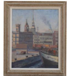
8056: FRAMED OIL ON BOARD PAINTING OF A HARBOR

A serigraph that depicts a horse. Pencil signed on the bottom and signature to read E. Salomon. Possibly by Edwin Salomon (1935 - 2014). He was an Israeli Postwar and Contemporary painter. The record sold price in auction is USD $6,900 for his work -- "The Herd", which was sold at Tiroche in 2010. H: 16 1/2 in. L: 12 3/4 in.