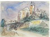
8193: 20TH CENTURY WATERCOLOR SKETCH OF THE TEMPLE

Framed, depicts a cityscape. Impressionism is a 19th-century art movement characterized by relatively small, thin, yet visible brush strokes, open composition, emphasis on accurate depiction of light in its changing qualities (often accentuating the effects of the passage of time), ordinary subject matter, inclusion of movement as a crucial element of human perception and experience, and unusual visual angles. Impressionism originated with a group of Paris-based artists whose independent exhibitions brought them to prominence during the 1870s and 1880s. The Impressionists faced harsh opposition from the conventional art community in France. The name of the style derives from the title of a Claude Monet work, Impression, soleil levant ( Impression, Sunrise ), which provoked the critic Louis Leroy to coin the term in a satirical review published in the Parisian newspaper Le Charivari .