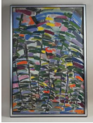
8009: ABSTRACT OIL PAINTING ON CANVAS