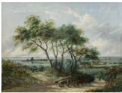
8048: OIL ON CANVAS PAINTING OF LANDSCAPE