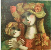
8067: MODERN PAINTING OF A MOTHER AND DAUGHTER