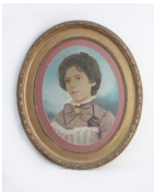
8202: PAINTING ON PAPER OF A LADY PORTRAIT