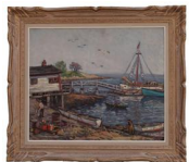
8210: GILTWOOD FRAMED OIL ON CANVAS OF A HARBOR

Framed, depicts a tranquil stream amongst a fall forest. Signature on bottom right to read RR. Renad, 1950. H: 17 in. x W: 13 1/8 in.