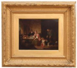
8216: DUTCH 19TH CENTURY PAINTING OF A FAMILY

Framed, depicts houses next to a lake in countryside. Signature on bottom right to read Louis Duval. H: 16 in. x L: 20 in.