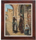
8224: OIL PAINTING BY SHLOSSBERG

Framed, depicts a city street scene. Signature to read Cher Hoeven. H: 26 in. L: 19 in.