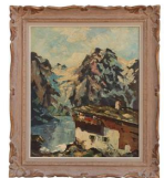
8226: OIL LANDSCAPE PAINTING BY CHER HOEVEN

Framed. One is napping and the other one is overlooking a wall. Signature on bottom left to read GW. H: 18 in. L: 14 in.