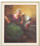
8051: FRAMED OIL ON CANVAS PAINTING OF A MAID READING

Depicts a majestic waterfall flowing down to a river. Signature on bottom right to read T. Albert. H: 18 1/4 in. x W: 15 1/4 in..