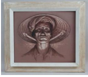
8170: OIL PAINTING OF A PORTRAIT OF A LADY BY SHLOSSBERG