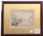
8077: DAVID COX, ENGLISH (1783 -1859)