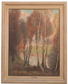
8157: FRAMED OIL ON CANVAS OF A FOREST