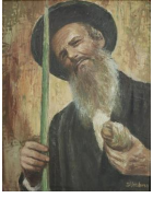
8204: OIL ON BOARD PAINTING OF A RABBI BY SHLOSSBERG