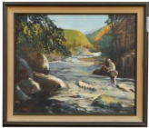
8206: FRAMED OIL PAINTING OF A FISHING MAN

Framed, depicts a beautiful girl with braids. Signature on bottom right to read Shlossberg. H: 17 1/2 in. L: 13 1/2 in.