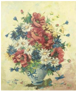
8121: OIL ON BOARD PAINTING OF STILL LIFE

Depicts village people passing through a snowy passage. Signature on bottom left to read H. Hiensch. H: 18 in. L: 24 in.