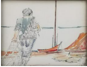
8066: PIERRE LAWTON, CANADIAN (1933 - )