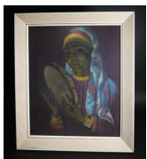
8227: OIL PAINTING OF AN EXOTIC MUSICIAN BY SHLOSSBERG

Framed, depicts a beautiful winter landscape. Signature to read Cher Hoeven. H: 24 in. L: 20 in.