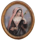
8054: GILTWOOD FRAMED OIL ON CANVAS PAINTING OF A LADY