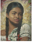
8205: OIL ON BOARD PAINTING OF A GIRL BY SHLOSSBERG

Framed, signature of bottom right to read Shlossberg. H: 20 in. L: 15 1/2 in,