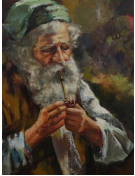
8034: 20TH CENTURY OIL PAINTING OF AN OLD MAN