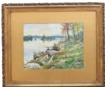
8076: FRAMED WATERCOLOR PAINTING OF A LAKE SCENE

Framed, a watercolor painting that depicts a bare tree in a barren land. Signature to read M. Stary. Marcel Stary (1918 - 1962) was a Canadian artist. He was born in the former Czechoslovakia and studied Art in Prague. Marcel escaped during the Soviet occupation and came to Montreal, Canada in 1948. He traditionally worked in oil, watercolor and acrylics. His subjects included the landscape and life of the Inuit people in the Arctic and Labrador. H: 14 1/4 in. L: 18 1/4 in.