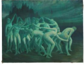
8016: OIL PAINTING OF A GROUP DANCING BY SCHLOSSBERG

An oil on board painting that depicts an abundance of ripe fruits on table with chalices. Signature on bottom right to read Y. Lanny.