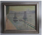
8190: 19TH CENTURY IMPRESSIONIST OIL PAINTING