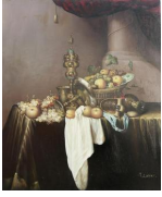
8015: OIL ON BOARD PAINTING OF STILL LIFE BY Y. LANNY