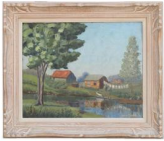
8215: CANADIAN 20TH CENTURY OIL PAINTING BY LOUIS DUVAL

Framed, depicts a pathway in a park. Signature on bottom to read P. M. Fabiano. H: 19 in. x W: 25 1/2 in.