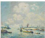
8044: OIL ON PAINTING OF A SEA COAST

Overlooking a river on a bridge. Signature to read H. Hiensch. H: 19 1/2 in. L: 23 1/2 in.