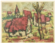
8175: FRAMED WATERCOLOR PAINTING OF HOUSES