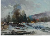
8038: OIL PAINTING ON CANVAS OF A WINTER LANDSCAPE