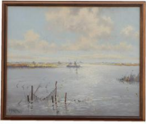
8052: FRAMED DUTCH OIL ON CANVAS PAINTING BY H. HIENSCH