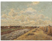
8019: OIL PAINTING OF HAYSTACKS BY H. HIENSCH

Oil on canvas painting depicts a beautiful seashore scene with waves crashing on the beach. Signature to on bottom right to read Carbu. Francois (Carbuccia) Carbu, was a French artist who was known for painting of seascapes and boats. H: 21 in. L: 39 in.