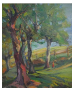
8228: OIL PAINTING ON CANVAS, OF A MAN AMIDST TREES

Framed, depicts a female musician playing a tamporine. Signature to read Shlossberg.