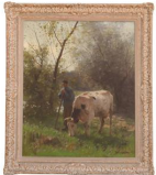
8151: GILTWOOD FRAMED OIL ON CANVAS PAINTING