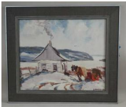
8011: OIL ON BOARD PAINTING OF A WINTER LANDSCAPE