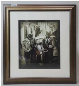
8199: PAINTING OF TWO MUSICIANS PLAYING JAZZ MUSIC