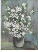
8155: FRAMED PAINTING OF POTTED BLOSSOMING FLOWERS