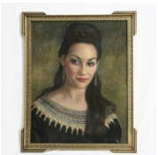
8195: PAINTING OF A PORTRAIT OF A LADY BY SHLOSSBERG

Framed, a watercolor painting. Signature on bottom. Leo (Lior) Roth (1914 - 2002) was an Israeli painter who was born in 1914. Roth's work was influenced by Cubism and bears much in common with the work of compatriot painter Naftali Bezem. His colorful canvases contain biblical imagery and references to early Israeli pioneer culture. The record sold price in auction is USD $6,900 for his work "The Shear", which was sold in 2015. H: 9 1/4 in. L: 5 7/8 in.