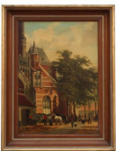
8124: DUTCH OIL ON BOARD PAINTING OF A TOWN SCENE

Giltwood framed, depicts a beautiful canal city. H: 9 1/2 in. L: 13 1/2 in.