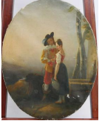
8146: ANTIQUE OIL ON CANVAS PAINTING OF LOVERS