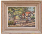
8171: FRAMED OIL ON CANVAS OF A VILLAGE SCENE

Giltwood framed, depicts a beautiful canal city, painted in fine details. H: 9 1/2 in. L: 13 1/2 in.