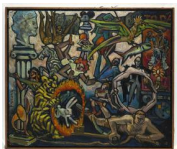
8247: FRAMED OIL ON CANVAS ABSTRACT PAINTING BY HERSEY

Framed. Depicting a beautiful landscape of a creek with foliage and trees, and mountains in the distance. Signature on the left bottom which is illegible. L: 20 in., H: 24 in.