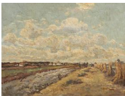
8112: OIL PAINTING OF HAYSTACKS BY H. HIENSCH

Framed, depicts a beautiful fall forest. Signature to the lower right which is illegible. H: 43 1/2 in. L: 33 in