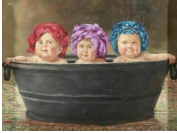
8239: OIL PAINTING BY ALFRED R OSBORNE