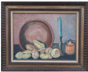
8243: FRAMED OIL PAINTING ON CANVAS OF STILL LIFE