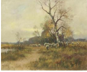
8240: DUTCH OIL ON CANVAS PAINTING OF A SHEPHERD