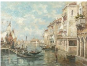
8052: OIL PAINTING ON CANVAS OF A CANAL CITY

Framed, signature to the lower right to read L de Mourer, dated 83. H: 40 in. L: 28 in.