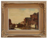
8170: GILTWOOD FRAMED PAINTING ON BOARD OF A DUTCH SCENE

Depicts the inside of a barn with roosters, birds and a duck eating. H: 11 1/4 in. L: 14 1/4 in.