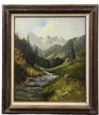
8245: FRAMED OIL PAINTING ON CANVAS OF FOREST

Framed, a watercolor painting that depicts a harbor scene. Signature to read Bagguley. H: 17 3/4 in. W: 23 1/2 in.