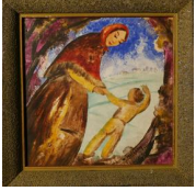
8145: PAINTED TILE OF A MOTHER AND A CHILD