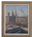
8114: FRAMED OIL ON BOARD PAINTING OF A HARBOR

Framed, titled "View of Portsmouth". Depicts a horse carriage which is full of wood logs, passing through a forest. H: 18 in. L: 24 in.