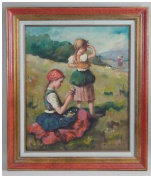
8190: FRAMED OIL PAINTING OF TWO GIRLS

Framed. Depicts a group of dancers having a great time.