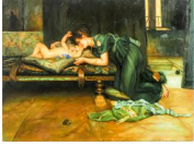
8064: OIL PAINTING ON CANVAS OF MOTHER AND BABY