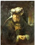
8068: OIL PAINTING ON CANVAS OF A RABBI

Depicts an old man cutting a loaf of bread in his house. Signature to read Hemu Savon. H: 16 in. L: 12 in.