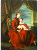
8066: BEAUTIFUL OIL PAINTING OF A MOTHER AND HER CHILD

Giltwood framed. Depicting a scene of two young lady and a little girl happily playing in the forest and picking beautiful flowers. H: 16 in. L: 12 in.