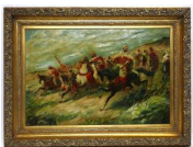
8055: FRAMED OIL PAINTING OF SOLDIERS ON HORSES

Framed, depicts kids playing hopscotch. Signature to read Allen Hadley. H: 36 in. L: 24 in.