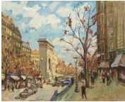
8241: OIL ON CANVAS PAINTING OF PORTE ST-DENIS, PARIS