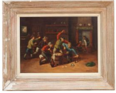
8168: FRAMED OIL ON CANVAS PAINTING OF A DUTCH SCENCE