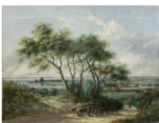
8113: OIL ON CANVAS PAINTING OF LANDSCAPE