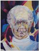
8158: OIL PAINTING OF AN OLD MAN

Depicts a table-full of seafood lying on a table. Signature on bottom right to read M. Dupead. H: 12 1/2 in. L: 31 in.