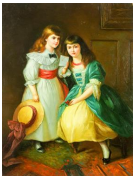
8070: OIL PAINTING ON CANVAS OF TWO YOUNG GIRLS