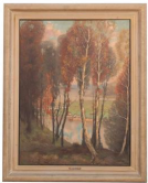
8111: FRAMED OIL ON CANVAS PAINTING OF A FOREST