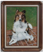
8191: OIL ON CANVAS PAINTING OF A DOG AND A WHITE CAT

Oil painting depicting two girls in an open field. One is making a flower crown, and the other is looking afar. Signature on the bottom right which is illegible.