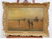
8049: WILLIAM TROST RICHARDS, AMERICAN (1833-1905)