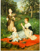
8065: OIL PAINTING ON CANVAS OF AFTERNOON PICNIC TIME

A woman in a green dress and jewelry, playing with a naked baby. H: 12 in. L: 16 in.