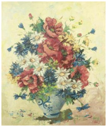
8188: OIL ON BOARD PAINTING OF STILL LIFE BY FW

Framed. Depicts a beautiful winter, snowy landscape. Signature on bottom right to read Gabris B. H: 20 in. L: 40 in.