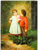
8069: OIL PAINTING ON CANVAS OF PLAYMATES