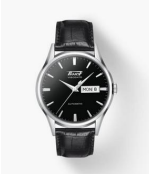
8030: TISSOT HERITAGE VISODATE AUTOMATIC MEN'S WATCH

Original. Tissot Le Locle Automatic COSC Men's Watch. (Ref: T006.408.36.057.00). NO BOX. Rose gold PVD stainless steel case with a black leather strap. Fixed smooth rose gold PVD stainless steel bezel. Black dial with rose gold-tone leaf-style hands and index hour markers. Arabic numerals mark the 3, 6, 9 and 12 o'clock position. Minute markers around the outer rim. Dial Type: Analog. Date display at the 3 o'clock position. ETA Caliber 2824-2 Automatic movement, based upon ETA 2824, containing 25 Jewels, biting at 28800 vph, and has a power reserve of approximately 38 hours. Scratch resistant sapphire crystal. Pull / push crown. Skeleton case back. Round case shape, case size: 39 mm, case thickness: 10 mm, band width: 19 mm, band length: 7.75 inches. Butterfly clasp. Water resistant at 30 meters / 100 feet. Functions: date, hour, minute, second. Le Locle Series. Casual watch style.