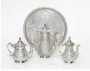
8050: PERSIAN SILVER FOUR-PIECE TEA & COFFEE SERVICE

The scalloped lobed bowl incised with figural scenic reserves against arabesque ground atop incised knob stem continuing to spreading domical foot. (Approximately 125 troy ounces).H: 16 in. Diameter: 18 in.