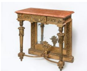
8052: FRENCH SQUARE TABLE

With green onyx round top above gilt-metal mounted frieze. Raised on three double columnar legs continuing to trefoil base with mounts and ending in animal paw feet.H: 31 in. Diameter: 16 in.