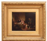
8138: DUTCH GILTWOOD FRAMED OIL ON BOARD PAINTING