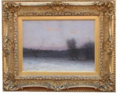
8103: CANADIAN OIL PAINTING OF WINTER LANDSCAPE

Giltwood framed, depicts a serene landscape of a pond with trees and tall shrubs. Clarence Alphonse Gagnon, R.C.A., (1881 - 1942) was a French Canadian painter, draftsman, engraver and illustrator, from the province of Quebec. He is well known for his landscape paintings of the Laurentians and the Charlevoix region of eastern Quebec.