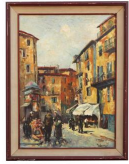
8142: OIL PAINTING OF A CITY SCENE BY CHER HOEVEN

Framed, depicts a shore scene with waves crashing on the shore. Signature on bottom to read Carbu. Francois (Carbuccia) Carbu, was a French artist who was known for painting of seascapes and boats. H: 21 in. L: 38 1/4 in.