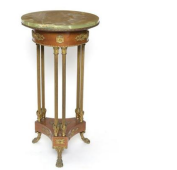
8051: EMPIRE STYLE MAHOGANY GUERIDON TABLE

With tray. Each covered baluster vessel incised overall with intricate arabesque medallions, bone handles, round tray; with hallmarks.