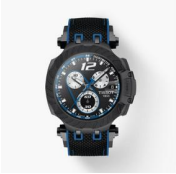
8031: TISSOT T-RACE THOMAS LUTHI 2019 LIMITED EDITION

Original. Tissot Heritage Visodate Automatic Men's Watch. (Ref: T019.430.16.051.01). NO BOX. Stainless steel case with a black leather strap. Fixed stainless steel bezel. Black dial with silver-tone dauphine-style hands and index hour markers. Minute markers around the outer rim. Dial Type: Analog. Day of the week and date display at the 3 o'clock position. ETA caliber 2836-2 automatic movement, based upon ETA 2824-2, containing 25 Jewels, biting at 28800 vph, and has a power reserve of approximately 40 hours. Scratch resistant sapphire crystal. Pull / push crown. Transparent case back. Round case shape. Case size: 40 mm. Case thickness: 12 mm. Band width: 20 mm, band length: 7.75 inches. Deployment clasp. Water resistant at 30 meters / 100 feet. Functions: date, day, hour, minute, second. Sport watch style.