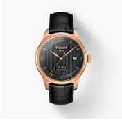
8029: TISSOT LE LOCLE AUTO AUTOMATIC COSC MEN'S WATCH