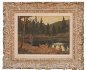
8105: CANADIAN OIL ON CANVAS PAINTING OF A FISHING MAN