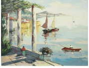
8119: 20TH CENTURY MODERN CANADIAN PAINTING

Framed, a beautiful oil painting that depicts a small waterfall and a tranquil, flowing river amongst forest. Signature on bottom right which is illegible. H: 12 in. L: 24 in.