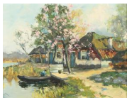
8145: OIL PAINTING OF A LAKESIDE HOUSE BY H. HIENSCH

Signature on bottom right to read CW. H: 18 in. L: 14 in.