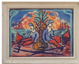
8136: FRAMED OIL ON BOARD PAINTING BY DUPOND

Framed. An oil on canvas painting that depicts a tranquil landscape scene. Signature on lower right to read H. Hiensch. H: 18 in. L: 21 1/2 in.