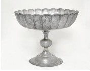
8049: LARGE PERSIAN FOOTED BOWL