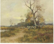
8148: DUTCH OIL ON CANVAS PAINTING OF A SHEPHERD

Framed. A lithograph of Kusama's signature style of a red colored pumpkin, against a black background. Yayoi Kusama (1929 - ) is a Japanese contemporary artist who works primarily in sculpture and installation, but is also active in painting, performance, film, fashion, poetry, fiction, and other arts. Her work is based in conceptual art and shows some attributes of feminism, minimalism, surrealism, Art Brut, pop art, and abstract expressionism, and is infused with autobiographical, psychological, and sexual content. She has been acknowledged as one of the most important living artists to come out of Japan. The record price for this artist at auction is USD $7.96 millions for "Interminable Net #4 from 1959", which was sold at Sotheby's Hong Kong in 2019. H: 16 1/2 in. L: 13 in.