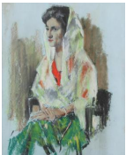
8121: A PORTRAIT DRAWING OF A LADY

Framed. An oil painting that depicts a bearded man. Signed on bottom which is illegible. H: 26 in. L: 21 3/4 in.