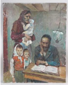
8141: OIL PAINTING OF A FAMILY

Framed, an oil on board painting that depicts a beautiful mountain scene. Signature on bottom right to read Redbarn. H: 12 in. L: 9 in.