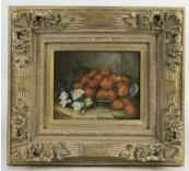
8084: FRAMED OIL ON BOARD PAINTING OF STRAWBERRIES