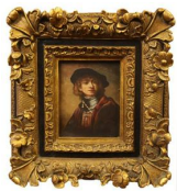
8100: FRAMED OIL PAINTING ON CANVAS OF A YOUNG GENTLEMAN

Framed. A drawing of an old man's portrait. Signed and numbered on the bottom which are illegible. H: 13 1/2 in. L: 10 5/8 in.