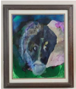
8132: FRAMED ABSTRACT OIL PAINTING BY MARITHE ROY

Framed, a drawing on paper that depicts two ships sailing off in to the sunset. Signature on bottom right which is illegible. H: 20 in. L: 20 in.