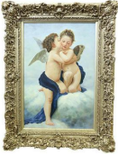
8043: FRAMED OIL ON CANVAS PAINTING OF CUPID AND PSYCHE

Depicts a beautiful lady dressing in a white, flowing dress in an outdoor scene. H: 36 in. L: 24 in.