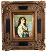
8103: FRAMED OIL ON CANVAS PAINTING OF A GIRL

In a beautiful giltwood frame, a beautiful oil on canvas painting that depicts a small town scene. H: 10 in. L: 8 in.