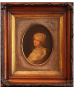
8061: OIL ON BOARD PORTRAIT PAINTING OF A YOUNG WOMAN

Framed. A Chinese ink drawing of a pine tree, with inscription on top left. H: 24 1/2 in. L: 11 1/2 in.