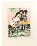
8070: MARC CHAGALL, RUSSIAN-FRENCH (1887 - 1985)

Framed. A print work that depicts a city scene. Signature on bottom right which is illegible. Print Only: L: 10 3/4 in. H: 8 in. With Frame: L: 19 in. H: 15 in.