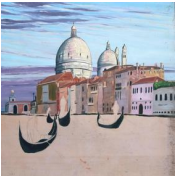
8143: A BEAUTIFUL PRINT OF A CANAL CITY

Framed, depicts a Basque woman who is dressing in a yellow dress, and balancing a basketful of fruits on top of her head. Signature on bottom left which is illegible. H: 19 in. L: 13 1/2 in.