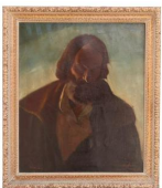
8120: FRAMED OIL ON CANVAS PAINTING OF A BEARDED MAN

Giltwood framed. An oil painting that depicts people working on a beach. Signed to read W. Richards. William Trost Richards (June 3, 1833 - April 17, 1905) was an important American landscape artist associated with both the Hudson River School and the American Pre-Raphaelite movement. Richards first public showing was part of an exhibition in New Bedford, Massachusetts, organized by artist Albert Bierstadt in 1858. In the 1870s, he produced many acclaimed watercolor views of the White Mountains, several of which are now in the collection of the Metropolitan Museum of Art. Richards exhibited at the National Academy of Design from 1861 to 1899 and at the Brooklyn Art Association from 1863 to 1885. He was elected a full member of the National Academy in 1871. Richards rejected the romanticized and stylized approach of other Hudson River painters and instead insisted on meticulous factual renderings. His views of the White Mountains are almost photographic in their realism. In later years, Richards painted almost exclusively marine watercolors. His works are featured today in many important American museums, including the National Gallery, the Smithsonian American Art Museum, the Wadsworth Atheneum, the Philadelphia Museum of Art, the Yale University Art Gallery, the High Museum of Art, the Museum of Fine Arts, Boston, the Fogg Art Museum, and the Brooklyn Museum of Art. Without Frame (Painting Only): H: 20 in. x W: 30 in. With Frame: H: 27 1/2 in. x W: 37 in.