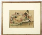
8135: FRAMED WATERCOLOR DRAWING OF A TOWN

Framed, a watercolor drawing of a park scene. Signature on bottom right which is illegible. H: 11 in. L: 15 1/4 in.