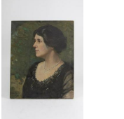
8209: OIL ON CANVAS PAINTING OF A LADY PORTRAIT

Of beautiful, blossoming yellow daisies. Signature on bottom right which is illegible. H: 18 3/4 in. L: 13 3/4 in.