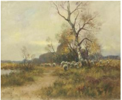
8229: DUTCH OIL ON CANVAS PAINTING OF A SHEPHERD

Depicts a bustling Parisian street scene. Signature on bottom right which is illegible. H: 20 in. L: 24 in.