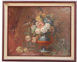
8125: FRAMED OIL ON CANVAS PAINTING OF STILL LIFE