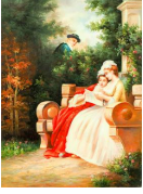
8072: OIL ON CANVAS PAINTING OF TWO LADIES READING