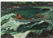
8223: OIL ON CANVAS PAINTING OF A SURVIVING SCENE

Depicts a beautiful, elegant lady in a blue dress. Unsigned. H: 24 in. L: 18 in.