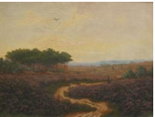
8046: FRAMED OIL ON CANVAS PAINTING OF LANDSCAPE