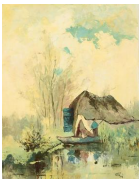
8225: CANADIAN PAINTING OF A CAMPING MAN IN FOREST BY CW