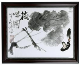
8059: FRAMED CHINESE INK DRAWING OF VEGETABLES

Framed. A drawing on paper of a trotting horse, with inscription on top right. Signature to read Xu Bei Hong. H: 25 1/4 in. L: 16 in.