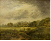
8074: OIL ON CANVAS PAINTING OF A PARK

Giltwood framed, depicts a noble man in a luxury royal dress, stands next to a status in the early 19th century room design. H: 16 in. W: 12 in.