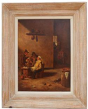
8067: DUTCH OIL ON CANVAS PAINTING OF GENTLEMEN SMOKING

Framed, titled "Jerusalem of the Towers". A watercolor painting that is mostly in blue and white color, depicts a mosque complex. The complex displays of domed ceilings and spires, men and women in cultural clothing. Pencil signed on bottom right which is illegible. With Frame: L: 26 in. H: 34 in. Without Frame: L: 17 1/2 in. H: 26 in.