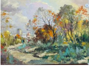
8021: BEAUTIFUL OIL ON CANVAS LANDSCAPE PAINTING