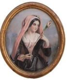
8215: GILTWOOD FRAMED OIL ON CANVAS PAINTING OF A LADY

Framed, a painting depicts two ladies in performing costumes. Signature to read Showell 63 on bottom. William Showell (1903 - 1984) was a Canadian painter, known for landscape, portrait and nude paintings. H: 18 in. L: 22 in.