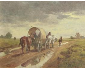
8231: MAGNIFICENT FRAMED OIL PAINTING

Framed. A watercolor painting that depicts a tranquil scenery of a lake amongst forest. Signature on bottom right to read M. Stary. Marcel Stary (1918 - 1962) was a Canadian artist. He was born in the former Czechoslovakia and studied Art in Prague. Marcel escaped during the Soviet occupation and came to Montreal, Canada in 1948. He traditionally worked in oil, watercolor and acrylics. His subjects included the landscape and life of the Inuit people in the Arctic and Labrador. H: 12 in. L: 16 in.