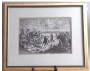
8111: FREDERIC REMINGTON, AMERICAN (1891 - 1909)