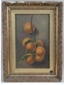
8130: OIL ON CANVAS PAINTING OF A BRANCH OF TANGERINES