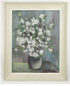
8138: FRAMED PAINTING OF POTTED BLOSSOMING FLOWERS