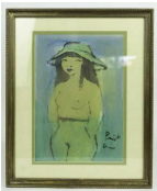
8026: FRAMED DRAWING OF A HALF NAKED LADY

An oil on canvas painting that depicts a majestic waterfall. Signature on bottom left to read Gregor. H: 24 in. L: 32 in.