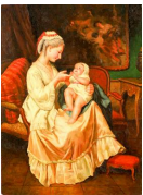
8062: OIL PAINTING ON CANVAS OF A MOTHER AND BABY

Framed. An oil on board painting of a portrait of a young woman who is wearing a scarf and smiling beautifully. Unsigned.L: 9 1/2 in. W: 10 1/2 in.