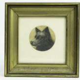
8034: FRENCH ENGRAVING OF A BLACK DOG BY JACQUES REBOUR