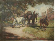
8001: OIL ON CANVAS PAINTING OF HORSES