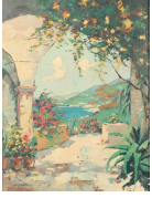
8164: OIL PAINTING OF ASCONA IN SWITZERLAND BY CW