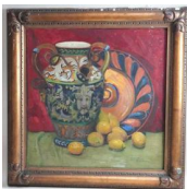
8128: STILL LIFE OIL PAINTING BY MAGDALENA BOSSICH

Framed, a modern oil painting that depicts a tranquil stream amongst a fall forest. Signature on bottom right to read RR. Renad, 1950.H: 17 in. x W: 13 1/8 in.