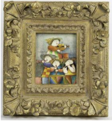
8028: JOYCE ROYBAL, BRITISH (1955 - )

Framed. A cartoon drawing of seven dogs of different breeds, urinating on a street. Unsigned.