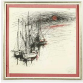
8131: FRAMED MODERN DRAWING OF SHIPS

Giltwood framed, depicts a branch of ripe tangerines hanging down. H: 10 1/2 in. L: 16 1/2 in.