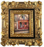
8104: FRAMED OIL PAINTING OF A FRENCH STREET SCENE

In a beautiful frame. An oil on canvas painting of a beautiful girl's portrait. Signature on bottom left to read Ahemis. H: 10 in. L: 8 in.