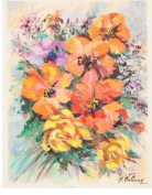
8165: FRAMED PAINTING OF FLOWERS BY J. WOLBERG

Framed. An oil painting of a beautiful patio located in Ascona, Switzerland. Signed to read CW.H: 18 in. L: 14 in.