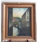
8113: OIL ON BOARD PAINTING OF A CANAL CITY SCENE