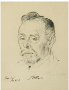
8099: DRAWING OF AN OLD MAN PORTRAIT