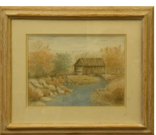
8048: FRAMED WATERCOLOR PAINTING OF A COUNTRYSIDE