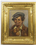
8071: FRAMED OIL PAINTING OF A PORTRAIT

Framed. Lithograph, titled: "Le Ciel de la Place de la Concorde." Pencil signed on the bottom. Honored for his distinct style and pioneering role among Jewish artists, Marc Chagall painted dream-like subjects rooted in personal history and Eastern European folklore. Chagall's style has been described as a hybrid of Cubism, Fauvism, and Symbolism, and his supernatural subjects are thought to have significantly influenced the Surrealists.