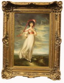
8042: OIL ON CANVAS PAINTING OF A YOUNG LADY