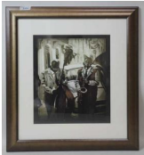
8169: PAINTING OF TWO MUSICIANS PLAYING JAZZ MUSIC

Framed, an oil painting depicts a cityscape. Signed on bottom right which is illegible.