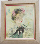
8057: OIL PAINTING ON CANVAS OF A BEAUTY BY CHER HOEVEN