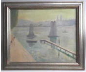
8168: FRAMED OIL PAINTING OF A CITY SCENE

Framed. A magnificent watercolor painting of a forest. Signature on the bottom to read M. Angus and dated 1890.