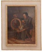
8189: FRAMED OIL PAINTING BY WILLIAM P. WOLFE