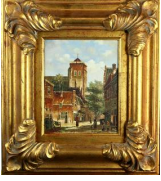
8102: FRAMED OIL ON CANVAS PAINTING OF A SMALL TOWN