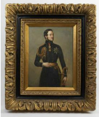
8075: FRAMED OIL PAINTING OF A NOBLE MAN

Depicts a grassland, and tree next to a pond. A city skyline in the background under a cloudy sky. L: 20 in. H: 16 in.