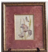
8114: LITHOGRAPH OF A PURPLE FLOWER BY BLUM

Framed. An oil on board painting of a canal city scene. Signed on bottom which is illegible.