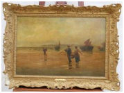
8119: WILLIAM TROST RICHARDS, AMERICAN (1833 - 1905)

Giltwood framed, depicts a serene landscape of a pond with trees and tall shrubs. Signed on bottom right which is illegible. The style of the painting is in the manner of Clarence Alphonse Gagnon. Clarence Alphonse Gagnon, R.C.A., (1881 - 1942) was a French Canadian painter, draftsman, engraver and illustrator, from the province of Quebec. He is well known for his landscape paintings of the Laurentians and the Charlevoix region of eastern Quebec.