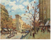
8228: OIL ON CANVAS PAINTING OF PORTE ST-DENIS, PARIS