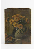
8208: OIL ON CANVAS PAINTING OF STILL LIFE