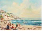
8013: OIL ON CANVAS PAINTING OF A BEACH SCENE BY MANELLI