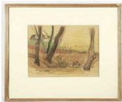
8134: FRAMED WATERCOLOR DRAWING OF A PARK SCENE