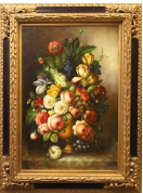
8036: FRAMED OIL ON CANVAS STILL LIFE PAINTING

Beautifully giltwood framed. An oil painting that depicts a luxurious bouquet of potted blossoming flowers. Unsigned. H: 36 in. L: 24 in.