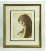
8022: FRAMED DRAWING OF A NAKED BEAUTY

An oil painting that depicts a pathway within a park. Unsigned but inscribed on bottom left to read Marallet Montreal. H: 23 in. L: 31 in.