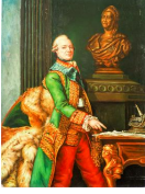
8073: OIL ON CANVAS PAINTING OF A NOBLE MAN

Depicting a scene of two ladies sitting on a chair reading book. A man is looking at them from the bush behind. H: 16 in. W: 12 in.