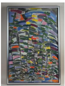
8129: FRAMED ABSTRACT OIL ON CANVAS PAINTING