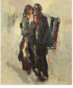
8227: OIL PAINTING OF A BOY AND A GIRL BY CHER HOEVEN