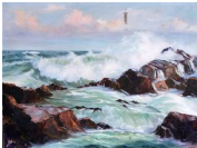
8080: OIL ON CANVAS PAINTING OF SEASHORE

Depicting a scene of people gathering in a park. Not signed. H: 48 in. L: 36 in.