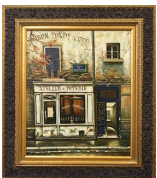
8023: OIL ON CANVAS PAINTING OF A PARISIAN STOREFRONT

Framed, depicts a path amongst a forest, painted with magnificent details. Signed by R. Whitely. H: 12 in. L: 16 in.