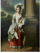
8075: LARGE OIL ON CANVAS PAINTING OF A BEAUTY