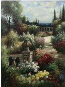
8220: OIL PAINTING ON CANVAS OF A GARDEN VIEW

The Baroque is a style of architecture, music, dance, painting, sculpture and other arts that flourished in Europe from the early 17th century until the 1740s L: 48 in. H: 36 in.