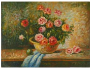
8071: OIL PAINTING ON CANVAS OF A POTTED FLOWER

A potted plants with plenty of beautiful and colorful flowers. H: 48 in. L: 36 in.