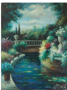
8225: OIL ON CANVAS OF A GARDEN VIEW

Oil on canvas of a beautiful European town by the water, with some boats parking by the shore. Signature is on the bottom right corner to read Charles Lakes. H: 48 in. L: 36 in.