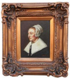
8200: FRAMED OIL PAINTING ON CANVAS OF A WOMAN

Signature to the lower right read Filaer. H: 12 1/4 in. L: 10 1/4 in.