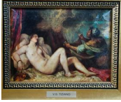
8017: PAINTING AFTER TIZIANO VECELLIO, OF DANAE

Dressing in a teal satin gown, looking regal. H: 36 in L: 24 in