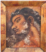
8199: FRAMED PAINTING OF A MAN'S PORTRAIT

Depicts an empty chair with a pair of ballerina shoes, a hanging tutu, a shawl and a white flower. Signature to read Cont E.