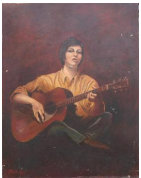
8193: OIL PAINTING OF A MAN PLAYING THE GUITAR

Painted with a palm tree in the front, and other categories as family, train, and carriage in the back. Unsigned.