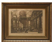
8038: FRAMED LITHOGRAPH OF RUINS

Framed. Depicts a small bouquet of yellow daisies in a glass jar. Unsigned. H: 24 1/4 in. L: 19 1/4 in.