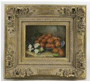
8236: FRAMED OIL ON BOARD PAINTING OF STRAWBERRIES

An oil painting that depicts a seashore scene, surrounding by some green trees. Signature on bottom right to read Leifton. H: 24 in. L: 36 in.