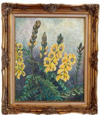
8222: OIL PAINTING ON CANVAS OF YELLOW FLOWERS

Magnificent landscape view of a river shore in a countryside in water color. Artist signiuture Leo Bromer . L: 27 1/2 in, H:12 1/2 in.