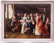
8183: OIL ON CANVAS PRINT OF A SOCIAL GATHERING

Depicting a small cottage amongst colorful blooming flowers. Signature on bottom lefthand corner. H: 48 1/2 in. x L: 56 1/2 in.