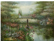
8082: LANDSCAPE OIL ON CANVAS PAINTING