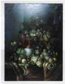
8077: OIL ON CANVAS PAINTING OF VASE AND GRAPES