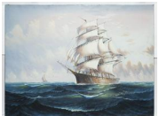
8072: OIL ON CANVAS PAINTING OF A SHIP AT SEA

A scene of a potted flower. Signature is on the bottom right corner. H: 36 in. L: 48 in.