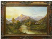
8018: FRAMED OIL ON CANVAS PAINTING OF A VALLEY

Lying naked on a bed with her head tilted to a man at the end of her bed. H: 4 in. L: 5 1/2 in.