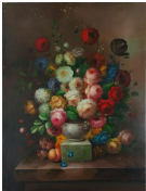
8070: OIL ON CANVAS OF A POTTED BOUNTIFUL BLOOMS

Depicting a scene of two ladies sitting on a chair reading book. A man is looking at them from the bush behind. H: 16 in. W: 12 in.