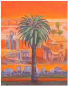
8192: OIL PAINTING OF A PALM TREE

Signature to read Ldsmourer. H: 30 in. L: 18 in.