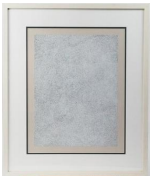
8184: AFTER YAYOI KUSAMA, JAPANESE (1929 - )

Depicts a group of nobles socializing next to a piano. 36 in. (L) x 48 in. (W).