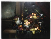
8186: OIL ON CANVAS PAINTING OF A STILL LIFE

Andy Warhol (American, 1928-1987), Gun Collection Photograph. Gelatin Silver Print. Medium: Photograph. Signature: Andy Warhol, and estate stamp on verso. Frame: included. Death emerged as a distinctive theme in Warhol's work in the 1960s, with his Marilyn Monroe portraits and the 'Death and Disaster' series. His fears about dying were heightened in 1968 when he was shot and critically injured by Valerie Solanas. The gun depicted here is similar to the .22 snub-nosed pistol that she used. At around the same time as he was painting guns Warhol was also doing a series of knife pictures. Indeed, the first idea was to show them together, along with some dollar-sign paintings, at the Leo Castelli Gallery in New York in January 1982. Property from a private California collection. H: 8 in. x W: 10 in. With Frame: H: 17 in. x W: 21 in.