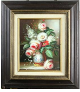
8180: FRAMED OIL ON CANVAS PAINTING OF FLOWERS