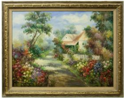
8182: LARGE FRAMED OIL PAINTING OF A GARDEN & HOME