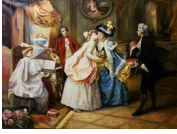
8219: OIL PAINTING ON CANVAS OF A NOBLE FAMILY

Signature to read G. Jluccetlo. H: 20 in. L: 24 in.