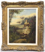
8190: OIL ON CANVAS PAINTING OF A BEAUTY

Giltwood framed. Depicts a group of ladies having a picnic at a park. H: 24 in. L: 30 in.