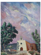
8171: OIL ON CANVAS PAINTING OF A CHURCH

Signature to the lower left. H: 30 in. L: 24 in.