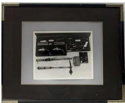
8185: ANDY WARHOL'S PHOTOGRAPH OF GUNS

Framed. Lithograph, After Yayoi Kusama's "White No. 28" Yayoi Kusama began painting "Infinity Nets," the artist's longest-running series, after moving to New York City in 1958. For Kusama, these abstract works covered in repeated, curved brushstrokes are an essential form of art therapy, inspired in part by her hallucinatory visions. "My nets grew beyond myself and beyond the canvases I was covering with them," she once explained. "They began to cover the walls, the ceiling, and finally the whole universe. I was always standing at the center of the obsession, over the passionate accretion and repetition inside of me." In pursuit of this infinite abyss, Kusama has even painted her "Infinity Nets" in uninterrupted sessions of 40 to 50 hours. In 2014, this influential series set records in the art market. Provenance Private Collection, California Acquired from the above by the present owner 13 in. x 15 1/2 in.