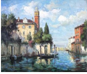
8218: OIL PAINTING ON CANVAS OF RIVERSIDE SCENE