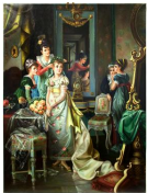
8078: OIL ON CANVAS PAINTING OF A BRIDE