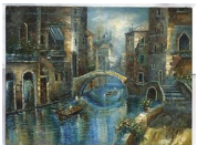
8073: OIL ON CANVAS PAINTING OF A CANAL CITY

Depicts a sailing ship in an ocean with rolling waves. H: 36 in. L: 48 in.