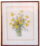
8037: FRAMED PAINTING OF DAISY

Framed, titled "Kings Lake (Bavania)". A handmade wood inlay picture of a landscape scene. With Frame: L: 19 in. H: 26 1/2 in. Without Frame: L: 14 1/2 in. H: 22 in.