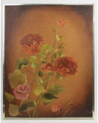
8107: OIL PAINTING OF BLOOMING FLOWERS

Giltwood frame. Signed on bottom right to read Benson. Painting Only: L: 11 1/2 in. H: 15 1/2 in. With Frame: L: 22 in. H: 27 in.