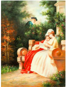
8069: OIL ON CANVAS PAINTING OF TWO LADIES READING

Giltwood framed, depicts a noble man in a luxury royal dress, stands next to a statue in the early 19th century room design. H: 16 in. W: 12 in.