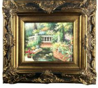
8181: GILT FRAMED OIL ON CANVAS PAINTING OF A POND

Signature to read Hartley. H: 10 in. L: 8 in.