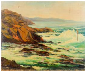
8019: OIL ON CANVAS PAINTING OF SEA COVE

Signature to read Robert E. Gorin. H: 36 in. L: 24 in. [Dimension without frame]