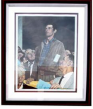
8194: FRAMED PRINT BY NORMAN ROCKWELL