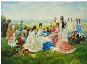
8081: LARGE OIL ON CANVAS PAINTING OF A PARK GATHERING