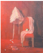
8198: OIL PAINTING ON CANVAS OF A EMPTY ROOM

Depicting a scene of a British soldier holding a girl.