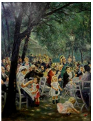
8079: OIL PAINTING ON CANVAS OF OUTDOOR GATHERING

Depicting a young girl in a wedding dress and a woman helping her put on a flowery veil, while other women look on. Not signed. H: 48 in., L: 36 in.