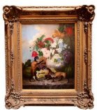
8170: GILT FRAMED PAINTING OF CHEEKY GIBBONS & FLOWERS