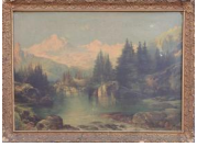
8195: FRAMED PAINTING OF A LAKE SCENE

Framed, a printwork titled " Freedom of Speech" Pencil signed on the bottom, signature to read Norman Rockwell. H: 30 in. L: 24 in.