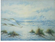
8076: LARGE OIL PAINTING ON CANVAS OF A BEACH LANDSCAPE

She stands leaning against a pillar holding a large feather in one hand and wears an elegant white dress and hat. Not signed. H: 48 in. L: 36 in.