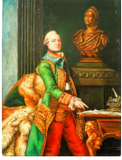
8068: OIL ON CANVAS PAINTING OF A NOBLE MAN

Giltwood framed. Depicts a young girl in matching pink bonnet, belt sash, and shoes. Sitting quietly on a bench.