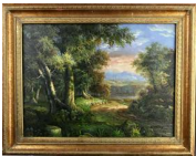
8022: FRAMED OIL PAINTING BY R. WHITELY

Artist's signature to the bottom right. H: 24 in. L: 36 in.