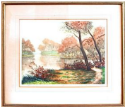
8221: BRITISH 20TH CENTURY LITHOGRAPH

A scene of a garden path, surrounding by many blooming flowers and trees. With the sea surrounded. H: 48 in. L: 36 in.