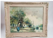
8237: FRAMED PAINTING OF A RURAL CITY SCENE

Giltwood framed. An oil on board painting that depicts a bunch of ripe strawberries with flowers on a table. Signed on bottom left to read Bellamy Carroll. With Frame: L: 19 in. H: 17 in. Painting Only: L: 9 in. H: 7 in.