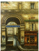
8074: LARGE OIL PAINTING ON CANVAS OF FRENCH STOREFRONTS