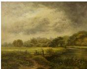
8125: OIL ON CANVAS PAINTING OF A PARK

With openwork carvings on the shoulder as well as on the lid and the finial. Beautifully painted with on the body with trees, birds and flowers. Six-character mark on the shoulder to read Jiajing. H: 25 in. x W: 11 in.