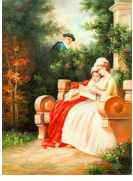
8119: OIL ON CANVAS PAINTING OF TWO LADIES READING