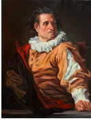
8120: OIL PAINTING ON CANVAS OF A NOBLE MAN

Depicting a scene of two ladies sitting on a chair reading book. A man is looking at them from the bush behind. H: 16 in. W: 12 in.