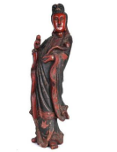
8121: CHINESE CARVED RED LACQUER GUANYIN