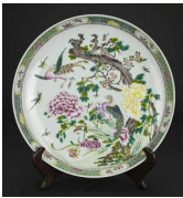
8129: CHINESE FAMILLE ROSE CHARGER

Beautifully painted with birds and blossoming flowers around the body and on the neck. Flanked by two pierced bamboo-form handles on the neck as handles. Circa 1950s. H: 21 in. x W: 14 1/2 in.