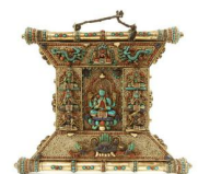
8035: ANTIQUE TIBETAN GILT BRONZE HANGING FRAME