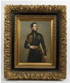
8126: FRAMED OIL PAINTING OF A NOBLE MAN

Framed. An oil painting that depicts a grassland, and tree next to a pond. A city skyline in the background under a cloudy sky. L: 20 in. H: 16 in.