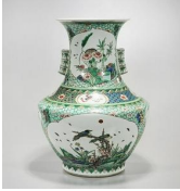
8128: CHINESE ENAMELED PORCELAIN VASE