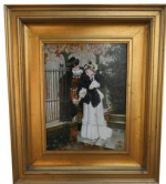
8123: OIL PAINTING ON CANVAS OF A COUPLE WHISPERING

In a garden sitting, wearing a large hat and looking up. H: 16 in. x W: 12 in.