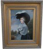
8122: FRAMED PORTRAIT PAINTING OF A NOBLE LADY

In a standing position with one hand holding a ruyi scepter and another hand holding a pearl. H: 26 1/2 in.