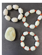
8039: GROUP OF FOUR CHINESE JADE PIECES