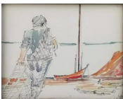
8133: PIERRE LAWTON, CANADIAN (1933 - )

Each porcelain panel is beautifully painted with landscape with inscription on top. Each is enframed with a beautifully carved wooden frame. Porcelain Plaque Only: H: 29 in. W: 8 1/2 in.