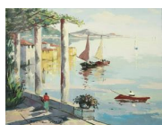
8037: MODERN OIL ON CANVAS LANDSCAPE PAINTING

Carved in great details, in light green and grayish white color. H: 7 3/8 in. L: 12 3/4 in.