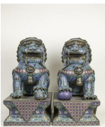
8008: PAIR OF MASSIVE CHINESE CLOISONNE FOO LIONS

Each with shaped, square based with four cast lions and rococo details. Decorations continue up the column. The circular sconces are shaped as a blossoming flower. H: 13 1/2 in.