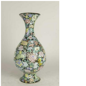
8058: CHINESE ENAMELLED MILLEFLEUR VASE

A charming and decorative carriage clock with light green wooden and glass case, with a metal handle on top. Beautifully painted with landscape scenes on the wooden case. H: 18 in.