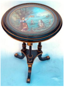
8005: EBONIZED WOOD AND PORCELAIN CENTER TABLE

Flanked by two nymphs on the sides as high handles. Beautifully decorated with raised cherubim and birds around the body. Mounted on an ebonized plinth. With Plinth: H: 13 1/2 in. Without Plinth: H: 12 in.