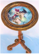
8006: BEAUTIFUL GILTWOOD AND PORCELAIN CENTER TABLE

Raised on three curved legs with beautiful gilt bronze details. With a finely hand-painted porcelain charger on the top center that depicts a maiden bidding farewells to ships, with a glass top.