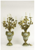
8060: PAIR OF GILT BRONZE & MARBLE EIGHT-ARM CANDELABRA

Sitting on top of the wooden base covered with a rug and holding a mirror. H: 22 1/2 in. W: 22 1/2 in.