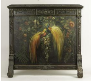
8025: EBONIZED CARVED WOODEN FIRESCREEN

Beautifully hand-painted with enameled blossoming tree around the bulbous body, against a golden brown background. Mark to the base.H: 8 1/2 in.