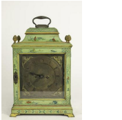
8057: C.R. CROOKSHANK MOVEMENT WOODEN CARRIAGE CLOCK

Beautifully painted with gilt details with cherubim in relief on the body, and on its bottom. Mounted on a gilt bronze base with rococo design, and wide gilt vertical bands, ring handles and rim frame secure the dish. H: 8 1/2 in. W: 16 1/2 in.