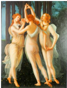
8127: OIL PAINTING ON CANVAS OF ETHEREAL WOMEN