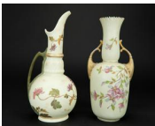
8188: TWO EUROPEAN PORCELAIN VESSELS