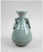
8124: CHINESE CELADON VASE WITH TWO RING HANDLES