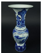
8245: CHINESE BLUE AND WHITE PHOENIX TAIL VASE

Framed, a drawing that depicts a man smoking a pipe. Signature to read Dudley Ward, dated 33. H: 23 1/2 in. L: 17 1/2 in.