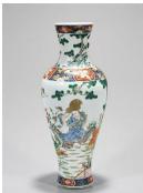
8164: CHINESE ENAMELED FIGURAL VASE

Framed. An oil on board painting that depicts a riverbank. Signature to read LABROSSE on bottom right. H: 13 in. L: 16 in.