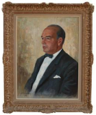
8179: GILTWOOD FRAMED OIL ON CANVAS PORTRAIT PAINTING