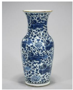
8238: 19TH CENTURY CHINESE BLUE AND WHITE VASE