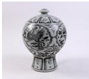
8240: UNUSUAL CHINESE BLUE AND WHITE VASE

Beautifully painted with foo lions amongst blossoming peonies and scrolling leaves all around the body. H: 17 in.