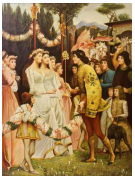
8128: OIL ON CANVAS PAINTING OF A WEDDING SCENE

Oil on canvas of three women in sheer dresses playing entangled in the forest.