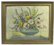
8181: FRAMED OIL PAINTING ON BOARD OF POTTED FLOWERS