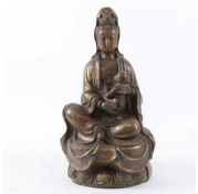
8268: CHINESE BRONZE STATUE OF A SEATED GUANYIN

Depicts a lady in flowing robe playing flute, in a frame. Signature on the bottom. D: 11 1/2 in.