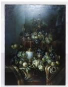
8126: OIL ON CANVAS PAINTING OF VASE AND GRAPES

Depicting a young girl in a wedding dress and a woman helping her put on a flowery veil, while other women look on. Not signed. H: 48 in., L: 36 in.