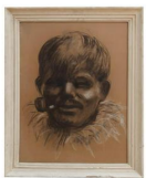
8244: FRAMED PORTRAIT OF A MAN BY DUDLEY WARD

Cast with great details, of a Japanese general dressing in a traditional armor.