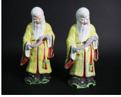
8122: SET OF TWO FIGURAL PORCELAINS OF A LONGEVITY GOD