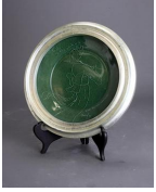
8265: FRAMED ETCHED GLASS BOWL OF A MUSICIAN