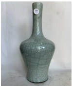
8182: 19TH CENTURY CHINESE CELADON CRACKLEWARE VASE