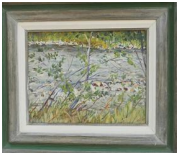
8162: OIL PAINTING ON BOARD OF A RIVERBANK BY LABROSSE

Framed. A watercolor painting that depicts a village scene. Signature on bottom right to read F. Ramus, dated 1914. Ferneley Ramus (1868 - 1937) was a prolific painter in both oils and watercolors. H: 9 1/4 in. L: 16 3/4 in.