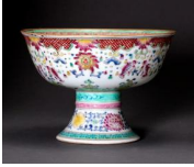
8082: LOVELY CHINESE WU CAI PORCELAIN STEM CUP