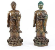
8151: BRONZE STATUE OF BUDDHA - SOLD SEPARATELY

Seated in a flowing gown on a double-lotus platform.