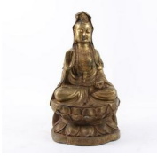
8150: CHINESE BRONZE STATUE OF A SEATED GUANYIN