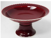
8138: CHINESE RED GLAZE PORCELAIN STEM DISH

Each painted with a crane in a pond with blossoming flowers, with a beautiful sky blue background. Both are in perfect conditions. H: 7 1/4 in.