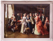
8283: OIL ON CANVAS PRINT OF A SOCIAL GATHERING

Plaque within a beautiful giltwood frame. Impressed mark on the back. Lot is in perfect condition. With Frame: L: 22 in. H: 18 3/4 in. Without Frame (Plaque Only): L: 16 in. H: 12 in.