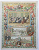
8267: LITHOGRAPH OF ROYAL FAMILIES

Depicts a naked stunt woman performing with her bicycle on a tightrope, with fire beneath her. Signed on top left.L: 6 3/4 in. H: 8 1/2 in.