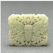
8099: CHINESE CARVED WHITE JADE PENDANT OF A MOTH

Of mottled green, white and lavender colors.