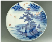
8153: JAPANESE BLUE AND WHITE CHARGER

Beautifully painted with blossoming flowers with scrolling vines all around the body, with a large flaring mouth.