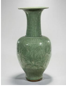
8132: ANTIQUE 18TH C. CHINESE CELADON CRACKLEWARE VASE