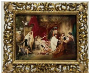
8281: A FINE PLAQUE OF GODDESSES IN A PARLOR