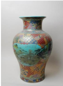
8196: LARGE CHINESE PORCELAIN VASE

Mostly in famille verte; depicting a picturesque scene of the palace grounds, with court yard filled with lush greens and scenic mountainous landscape behind the palace. Orange wings attached as handles on the neck of the vase. Squared stamp in iron red on the base. H: 16 1/2 in.