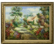
8284: LARGE FRAMED OIL PAINTING OF A GARDEN & HOME

Depicts a group of nobles socializing next to a piano. 36 in. (L) x 48 in. (W).