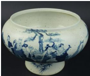
8161: CHINESE UNUSUAL BLUE AND WHITE STEM JAR

Painted with a marine scene around the body.