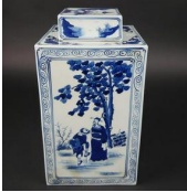
8055: ANTIQUE BLUE AND WHITE SQUARE VASE WITH LID