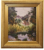
8191: OIL ON CANVAS PAINTING WITH PALM TREES