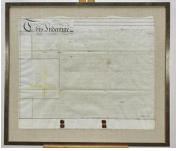
8046: LARGE ANTIQUE FRAMED BRITISH INDENTURE DOCUMENT

Ormolu-mounted, beautifully painted with cartouche of a lover's scene and blossoming flowers on the body, against a sky blue background. Flanked by a gilt bronze handles with rim. Mark on the bottom. H: 10 1/4 in. L: 17 3/4 in. W: 8 1/2 in.