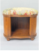
8030: A CLASSIC UPHOLSTERED OCCASIONAL STOOL