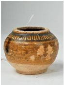
8155: SMALL ANTIQUE CHINESE POTTERY JAR

Framed. A print work that depicts a young beauty dress in a white, off-shoulder chignon dress looking to her right. H: 24 in. L: 20 in.