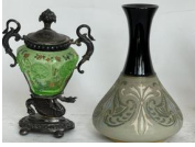
8151: GROUP OF TWO ASSORTED ITEMS

Each vase is flanked by a long, narrow neck. H: 10 1/4 in.