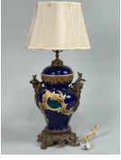
8031: BRONZE-MOUNTED PORCELAIN VASE, TURNED TO A LAMP