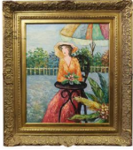
8192: OIL ON CANVAS OF A WOMAN SEATED IN GARDEN

Framed. An oil on canvas painting that depicts palm trees amongst a forest. Signature to read Denise 87. H: 24 in. L: 20 in.