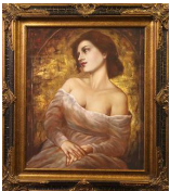
8154: OIL ON CANVAS PRINT OF A BEAUTY

Framed. A modern painting that depicts a woman with headscarf with her bird. Signature to read Dluar. H: 20 1/2 in. L: 27 in.