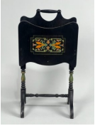
8033: VINTAGE HAND-CRAFTED FILE AND MAGAZINE STAND

In a beautiful blue robe and elaborate headdress, with a wooden stand. H: 12 1/4 in.